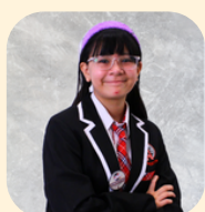
Sienna Year 7 Affection

Students also learned about the four layers of the rainforest: forest floor, under-canopy, canopy, and emergents. They discovered a variety of plant species, including ferns, palm trees, pandan leaves, inedible mushrooms, beehive ginger, and wild raspberries.