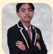
Rayden Year 8 Affection

Batu Caves is a series of stunning limestone caves located just north of Kuala Lumpur, a national landmark recognized by UNESCO. It has three main caves featuring temples and Hindu shrines, where people offer prayers and sacrifices.